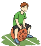
space hopper race